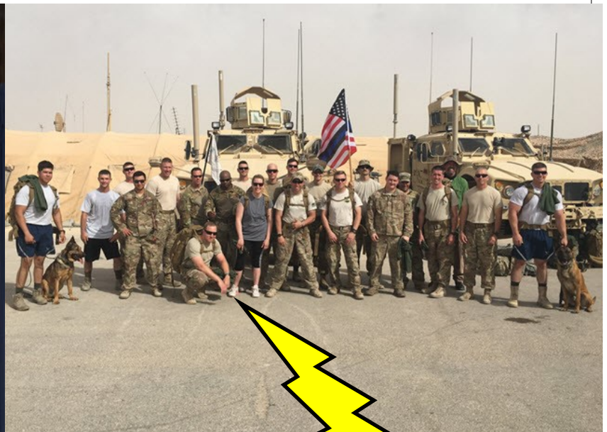
Ghostwalkers return from Ruckmarch