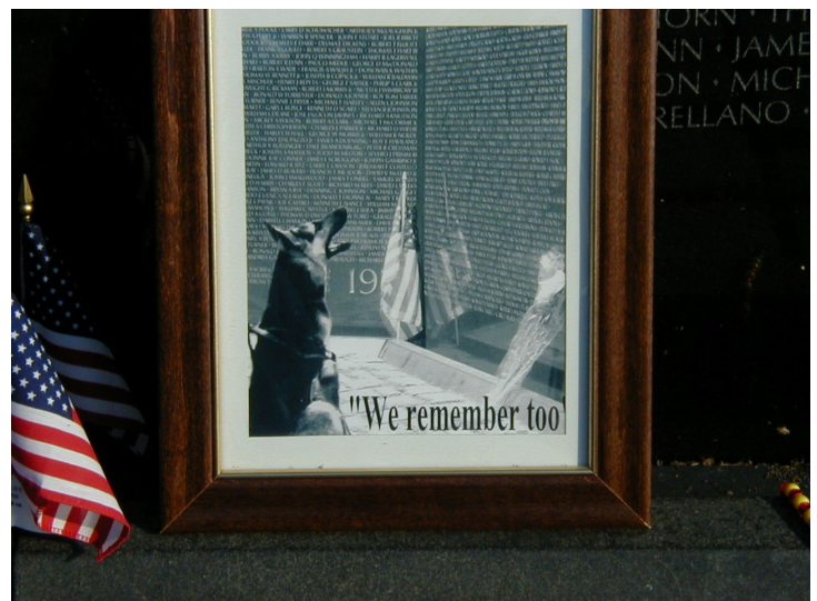
A photo of one of the many mementoes, left at “The Wall” every year. Our Military Working Dogs performed courageously then, as they still do today.