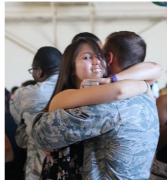
I missed you!

The Safeside Association commends every member of the 822 nd BDS and 820 th COS for their exemplary service and want to say, "WELCOME HOME."